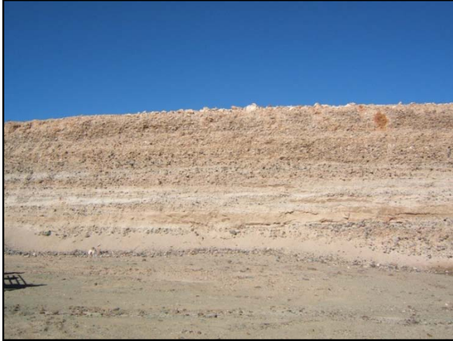
Fluvial-alluvial gravel unit being bulk-sampled on Wouterspan showing basal gravel unit and overlying "middlings" gravels

Thin (<2m), extensive Rooikoppie blanket the property. The fluvial-alluvial sequence is comprised of a basal gravel overlain by a generally upward-fining sequence with hanging gravel lenses known as "Middlings". The sequence is covered by a (non-silcreted) calcrete cap, generally less than 5m thick. Post-depositional weathering of this calcrete has formed solution hollows called "makondos" which are often filled with diamond-enriched Rooikoppie gravels.