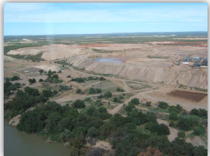
C-Terrace on Wouterspan mine (20-40m above present river level)

The Wouterspan deposit comprises an extensive flat lying alluvial sequence located on the right bank of the modern Orange River extending across an area of approximately 4x3km. The bedrock is well exposed in the workings and shale and tillite of the Karoo age Dwyka Group, are common. The bedrock displays an irregular erosional surface with gully and pothole features creating high diamond trapping potential. At Wouterspan, the gravel terrace occurs approximately 20-40m above the Orange River and appear to have been deposited in a braided river environment. These terraces are, probably, of lower to intermediate age.